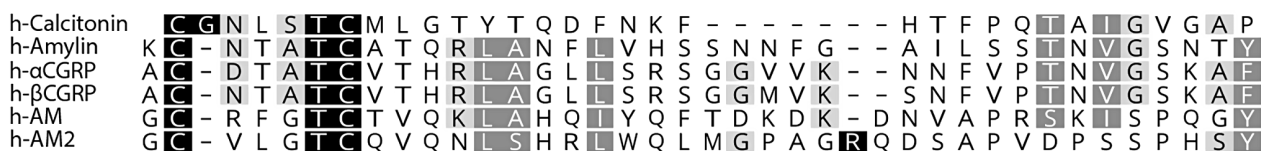
FIGURE 1 Amino acid sequence alignment of human peptides. Alignment performed using Clustal. The black background with white text indicates an exact match across peptides at a given position, dark gray with white text indicates >80% similarity across a position, and light gray with black text indicates 60%–80% similarity across a position; scoring was performed in Geneious using a BloSUM matrix of 80 and a threshold of 2. The adrenomedullin (AM) and AM2 sequences shown here omit the N-terminal 14 and 13 amino acids of each peptide, respectively. These N-terminal amino acids do not appear to be required for peptide function 3 and are thus omitted from the figure; however, they were included in the original alignment.

Receptors for the calcitonin peptide family consist of two class B G protein-coupled receptors; the calcitonin receptor (CTR), and the calcitonin receptor-like receptor (CLR), both of which can interact