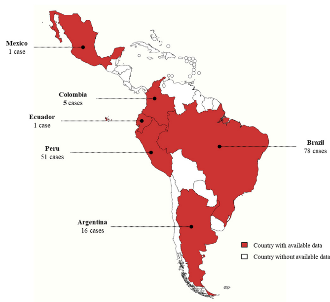
FIG. 2. Cases of co-infection between COVID-19 and dengue in Latin America. Only coinfection cases from Latin American countries reported in selected studies were included. Updated September 4, 2021.

dengue treatment and to ensure that district authorities use these funds effectively [57].