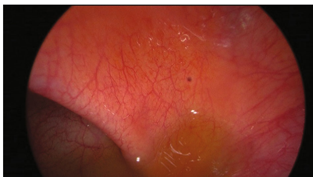
FIGURE 3: Dark macular lesion on the right abdominal wall.

lesions on the right abdominal wall and pelvic sidewall (Figure 3) and mixed dark and clear vesicular lesions on the small bowel mesentery. The omental adhesion was divided with diathermy. The small bowel was inspected from duodenojejunal flexure to terminal ileum, demonstrating viable decompressed bowel and no other pathology.