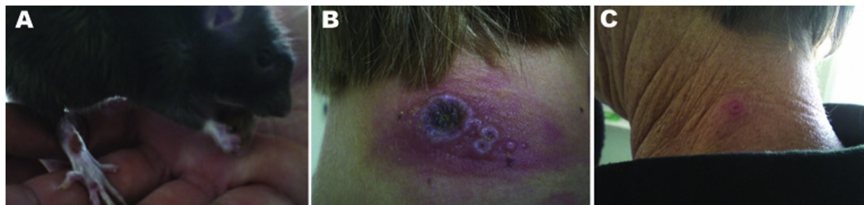
Figure 1. Cowpox lesions on a pet rat ( Rattus norvegicus ) and its owners during an outbreak in Germany in 2009. 21 A, Pet rat with a cowpox lesion on its right forepaw. B, Cowpox lesions on the neck of a pet rat owner without previous vaccinia virus vaccination (VTV) for smallpox 13 d after direct contact with her cowpox-infected pet rat. Regional lymphadenopathy was also described. C, Milder, nearly asymptomatic lesions on the neck of the patient's grandmother, who had a history of VTV for smallpox, 13 d after direct contact with the family's pet rat.

then extracted DNA from cell culture preparations from patient lesions to amplify viral genomes. 23 The results indicated that 3 closely associated patients (2 sisters and their sick pets' veterinarian) were infected with the same the cowpox strain. 23