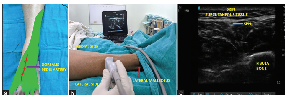
Figure 1: (a) Shows the sensory innervation of the superficial peroneal nerve in the dorsalsurface foot (green color), the hypothetical dorsalis pedis artery shown as the red line. (b) Shows linear ultrasound probe position 5–10 cm above the lateral malleolus. (c) Ultrasound image showing the superficial peroneal nerve in the lateral compartment of the leg. (SPN: Superficial peroneal nerve)

To conclude, SPN block is a simple technique that can provide excellent analgesia for dorsalis pedis AC. Effective procedural pain management can improve the success rate of cannulation, and enhance patient cooperation and comfort.