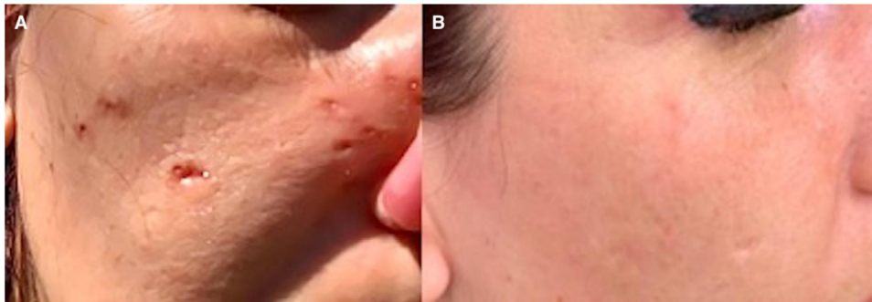
A. Deep chemical burns on right cheek after at home trichloroacetic acid peels B. Results 10 months after 3 fractionated non-ablative laser treatments