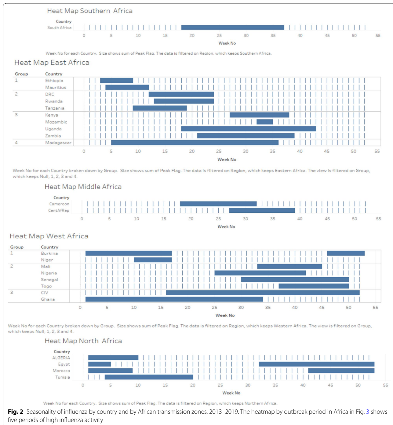
Fig. 2 Seasonality of influenza by country and by African transmission zones, 2013–2019. The heatmap by outbreak period in Africa in Fig. 3 shows five periods of high influenza activity