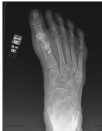
Postoperative radiographic imaging showing removal of tophi, first MTP joint deformity correction, and second PIP joint resection arthroplasty. MTP = metatarsophalangeal, PIP = proximal interphalangeal

cases, the diagnosis of gout was in association with a procedure performed for a sesamoid fracture. 43,44 Given that sesamoid pain can be difficult to treat non-surgically, consideration to gout as a differential diagnosis is reasonable; however, based on the few reported cases, it is likely a rare etiology. 41