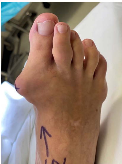
Gouty tophus associated with hallux valgus deformity and painful tophus in the second toe.