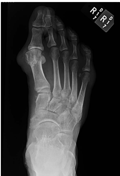
Radiographic imaging of gouty tophus associated with hallux valgus deformity showing joint destruction and medial soft tissue of tophus (author's clinical photograph).

diagnosis of exclusion and ultimately confirmed with histologic examination at the time of surgery. None of these patients reported a history of gout or had a preoperative elevated uric acid level. All cases were treated with either partial or complete excision of the affected sesamoid with resolution of symptoms. In two of those