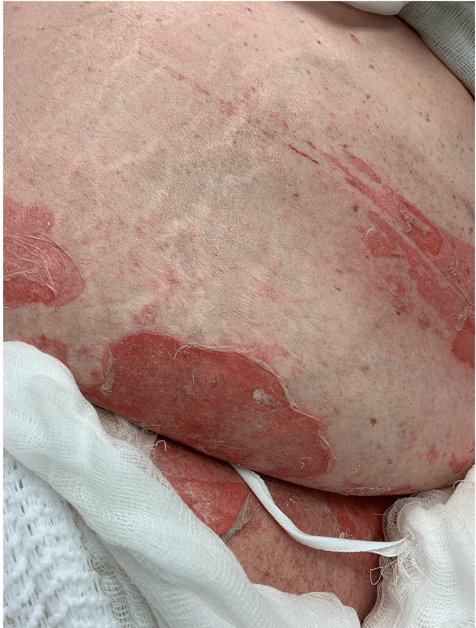
FIGURE 2: Sheet-like desquamation on the abdomen

H&E revealed a pauci-inflammatory subepidermal blister with few lymphocytes, eosinophils, and neutrophils (Figure 3). The DIF showed prominent linear IgA deposition at the DEJ. The second set of skin biopsies examined by an outside laboratory confirmed similar results. Indirect immunofluorescence (IIF) showed linear IgA antibody deposition on the epidermal side of salt-split skin. These findings were most consistent with a diagnosis of LABD.