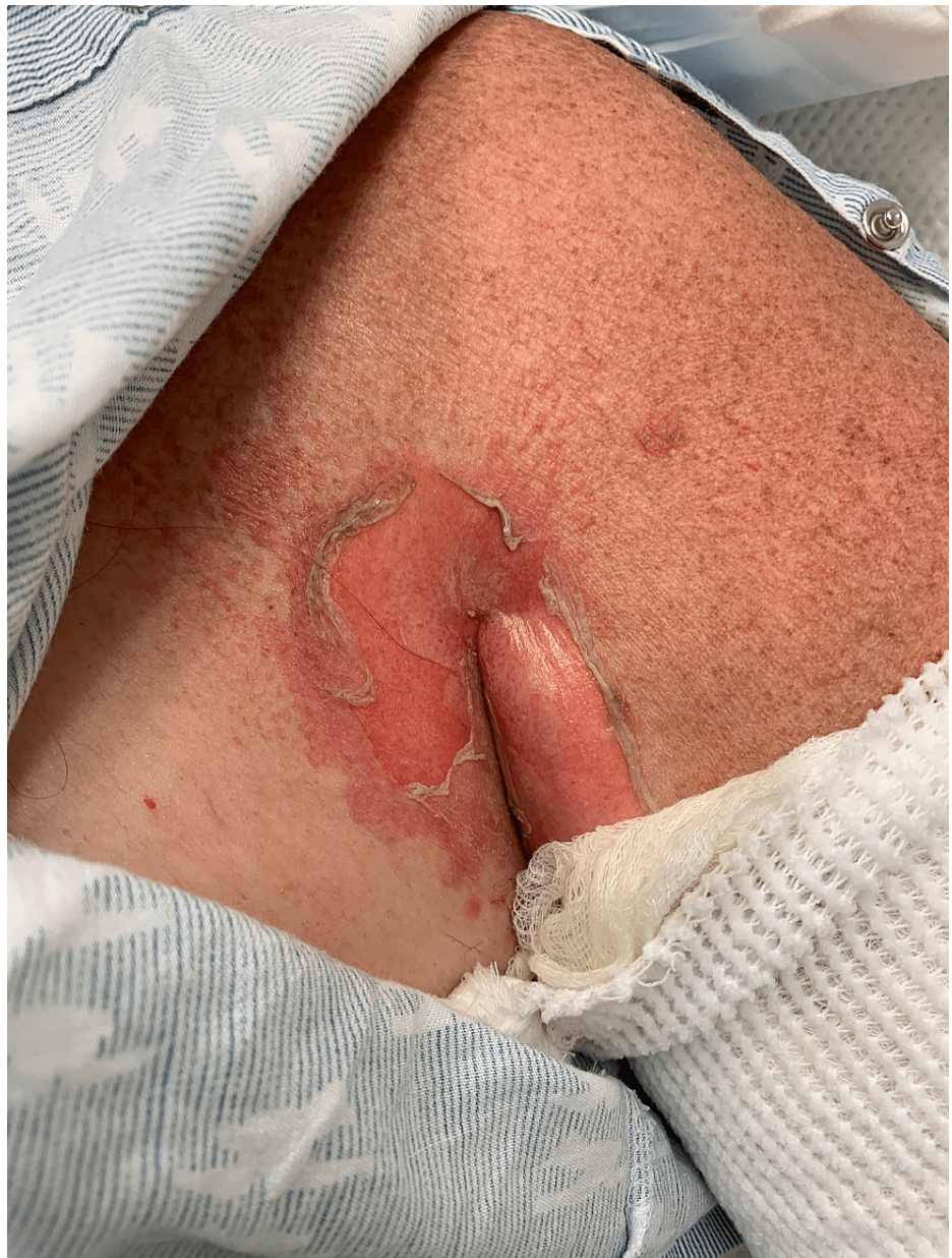
FIGURE 1: Sheet-like desquamation in the axilla