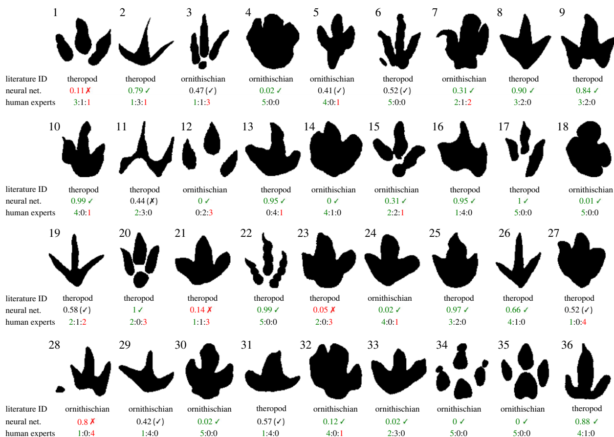
Figure 1. The test set was used to compare the performance of the neural network model with that of five human experts. The neural network returned values between 0 and 1, with values less than 0.5 indicating more ornithischian-like shapes and values greater than 0.5 indicating theropod-like shapes. Values between 0.4 and 0.6 are here considered as ‘ambiguous’. Human experts marked each track as either ‘ornithischian’, ‘ambiguous’ or ‘theropodan’. The ratio between correct, ambiguous and incorrect identifications of these five experts is shown for each track.

achieved by random horizontal flipping; rotation by a random value between -30 and +30 degrees; and a slight random shift in x and y directions. These operations were performed on each image before each epoch—as our model was trained with 74 epochs, 74 versions per image were created.