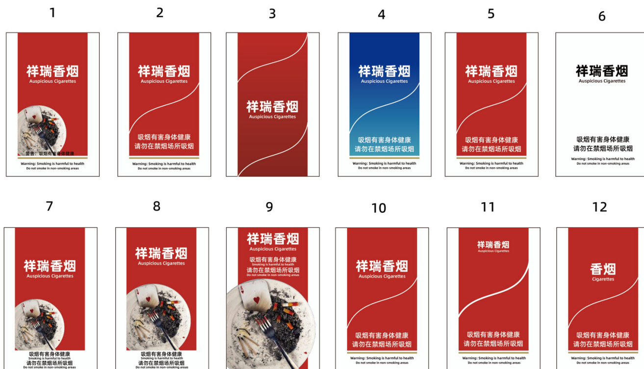
Figure 1. Picture of the cigarette box packaging used in the questionnaire survey.