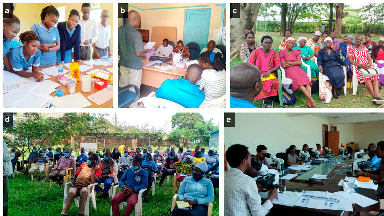
FIGURE 2. Community engagement in ICEMR activities in Kenya and Ethiopia: (A) health facility nurses receiving training in malaria passive surveillance; (B) meeting with hospital management team; (C) community health workers receiving training in active surveillance; (D) indoor residual spray training of community operators; and (E) malaria diagnosis training of ICEMR staff.

malaria vector surveillance and monitoring impact of vector control interventions.