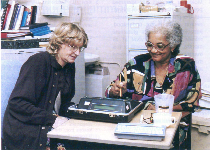
Fig 2. Speech therapist training patient in the use of a speech synthesiser.

palsy and can be treated with antidepressants (Table 7). Carers need support as well: strain within a family or relationship can be made much worse by MND. Individual treatment will vary according to need, from antidepressants to regular respite care, but time should be taken to enquire about the impact of MND on all those whom it touches 10 .