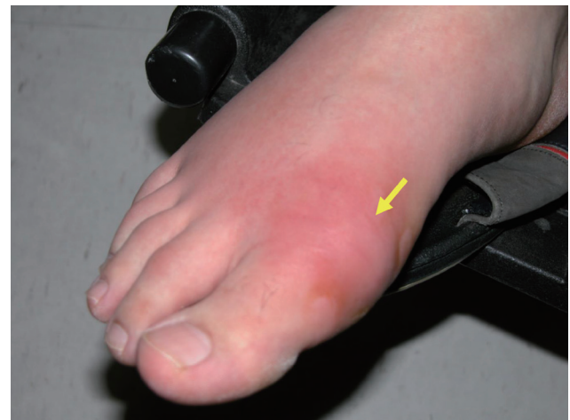
Figure 5. Acute inflammatory arthritis in a patient with gouty arthritis. The yellow arrow indicates acute inflammation with swelling of, and redness at, the base of the left great toe in a patient with gouty arthritis.

Gout is an inflammatory form of arthritis in which monosodium urate crystals are deposited in the joints because of hyperuricemia [71]. Gout and diabetes interact in that each condition increases the incidence of the other, reflecting the correlation between hyperuricemia and insulin-resistance [72]. Although gout is a well-known major risk factor for