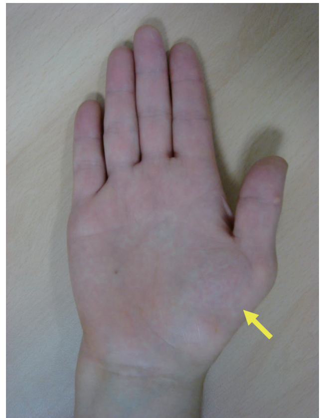
Figure 2. Thenar muscle atrophy in a patient with carpal tunnel syndrome. The yellow arrow indicates thenar muscle atrophy reflecting the severe and prolonged median nerve compression of carpal tunnel syndrome.

Stenosing tenosynovitis (commonly termed trigger finger) is caused by inflammation attributable to repeated friction between the flexor tendon and the sheaths that form the tunnel affording mechanical stability to that tendon [40]. Inflammation causes the tendon and sheaths to swell and form nodules. The flexor tendon becomes trapped in the tunnel, and the finger joint is then locked in flexion (Fig. 3A) [41]. The prevalence in diabetic patients is 5% to 20%, much higher than the 1% to 2% in general populations [42]. Unlike in such populations, trigger finger in diabetics is more