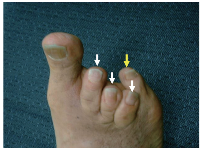
Figure 4. Foot deformities in a patient with diabetic neuroarthropathy (Charcot arthropathy). Patients with diabetic neuropathy may exhibit various foot deformities depending on the locations of the microfractures. As shown in this photograph, the toes may be curved to the medial side (yellow arrow) or be claw-like (white arrows).

Adhesive capsulitis (AC), also termed "frozen shoulder" (by the American Academy of Orthopedic Surgeons), is "a condition of varying severity characterized by the gradual development of global limitation of active and passive shoulder motion where radiographic findings other than osteopenia are absent" [51]. AC is triggered by inflammation that in turn causes fibrosis of the glenohumeral joint capsule and adhesion of surrounding structures [52]. Diabetes is a significant risk factor for AC; the prevalence in diabetics is 19% to 29%, much higher than the approximately 5% in general populations [53,54]. Old age, long diabetes duration, and poor glycemic control increase its prevalence, and the prognosis is poorer in diabetics than general populations [53,55]. It is accompanied by progressive stiffness and significant restriction of the range of motion [56]. Pain or a limited range of motion develop during sudden movements such as shoulder external rotation or abduction [57]. Diagnosis is based primarily on clinical symptoms and physical examination. As the incidence of rotator cuff tendinopathy is also approximately 1.5-fold higher in diabetics than general populations, this condition should be considered during differential diagnosis of AC [58,59]. Non-contrast, shoulder magnetic resonance imaging (MRI) aids the differential diagnosis [60]. Most cases of AC resolve over time; physiotherapy and oral analgesics may accelerate symptom relief [61].