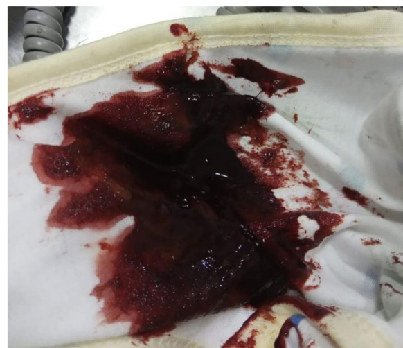
Fig. 1 Haematochezia of the baby

When the baby was 7 h old, the baby had much haematochezia. Laboratory examination showed haemoglobin, 17.5 g/dL; leukocytes, 21,180/uL; platelets, 381,000/uL; and haematocrit, 51.9%, and increasing PT, aPTT and INR. No abnormalities were found on the babygram and abdominal ultrasound. Currently, checking the levels of clotting factors II, VII, IX, and X cannot be done because the reference laboratory does not have examination facilities. The working diagnosis was gastrointestinal bleeding due to idiopathic early-onset VKDB. The baby received vitamin K1 2 mg IM, 2 × 60 ml Fresh Frozen Plasma (FFP), and 30 ml Packed Red Cells (PRC) transfusion. On the way, aged 19 h, the baby experienced many hematemeses. At 26 h, meconium was only slightly mixed with blood. At the age of 30 h, the baby can drink well. The patient went home after PT, aPTT, and INR had decreased to the normal limit. The baby's mother was happy that her child was safe and healthy.