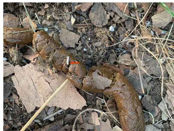
Fig. 1 Representative images of feces containing Dipylidium segments. Arrow indicates tapeworm segment