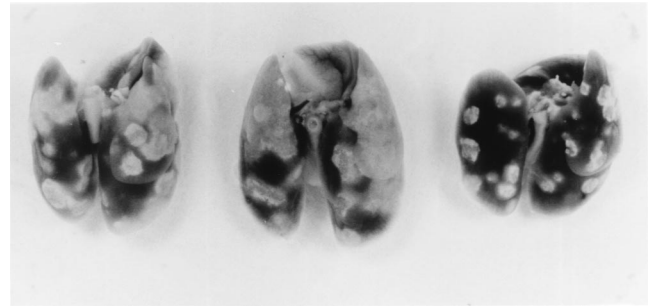
FIG. 3. Appearance of the lungs of mice infected by aerosol with approximately 10^2 CFU of CDC1551 (right), H37Rv (left), or Ravenel (center) on day 120 of infection. Ravenel caused the most lung pathology, followed in turn by H37Rv and CDC1551.

made by some (12, 15) and not by others (9, 13). According to one group (10), the extent to which a given M. tuberculosis strain is able to cause pathology in a given period of time is the most useful measure of its virulence. Based on this measure, strain CDC1551 is not a particularly virulent strain of M. tuberculosis , in spite of its highly infectious nature. At this time there seems to be no scientific basis for believing that recently isolated strains are more virulent than long-established reference strains such as H37Rv and Ravenel, which were isolated nearly 100 years ago. It should be pointed out that the C57BL/6 mouse strain employed in this study is considered to be an M. tuberculosis -resistant strain (7).