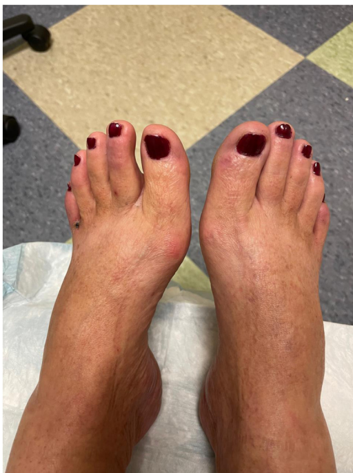
Fig. 2. Bilateral feet of patient after completing cilostazol therapy. These are the dorsal aspects of the patient's bilateral feet after completing 4 weeks of treatment with cilostazol. The previously noted violaceous lesions and blisters are resolved.

a bulbous appearance to the distal aspect of the toes: something we refer to as "lightbulb toes." We find pernio to be a clinical diagnosis and have not felt dermatopathology to alter the clinical course of these patients. We report the case of a middle-aged woman with pernio-like lesions who had previously received two doses of a COVID-19 vaccine and had no prior diagnosis of COVID-19; however, she had SARS-CoV-2 antibodies and recent symptoms that suggested possible COVID-19 infection. Her pernio-like symptoms resolved after 4 weeks of treatment with cilostazol.