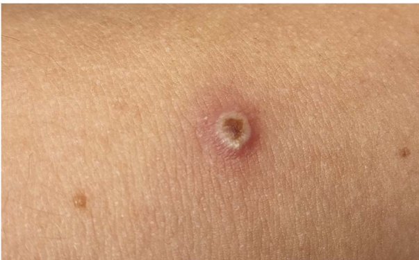
Figure 2. A closer view of the central umbilicated lesion.

monkeypox pandemic, pertinent history, and characteristic lesions, a monkeypox PCR test was also sent. For the HSV and monkeypox PCR tests, two separate swabs were taken from the penile and the skin lesions. The STI panel was negative for HSV, chlamydia, gonorrhea, HIV, and treponema pallidum , however, monkeypox was positive.