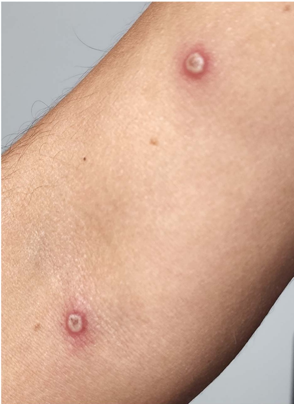
Figure 1. Multiple central umbilicated lesions over the forearm.