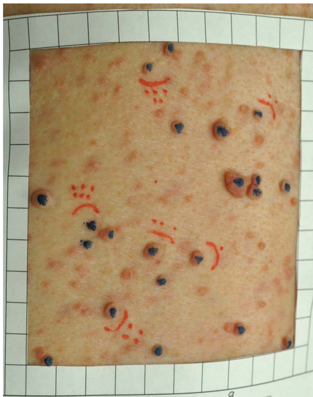
Blue indicates cNF lesions that were counted (>4 mm). Red indicates the cNF lesions that were measured.

These procedures may allow a more sensitive measure of change over time or in response to therapy. 12,13 The high resolution of these techniques may shorten the observation period and provide the opportunity to intervene earlier in the course of cNF development. OCT can provide a visualization of the full structure of normal human skin at a resolution of approximately 5 \mu m, enabling the visualization of sweat ducts, capillaries, and blood flow. However, nerve endings are under 2 \mu m in diameter, which is below the resolution of OCT, so there are limitations with respect to visualization of some aspects of the cNF.