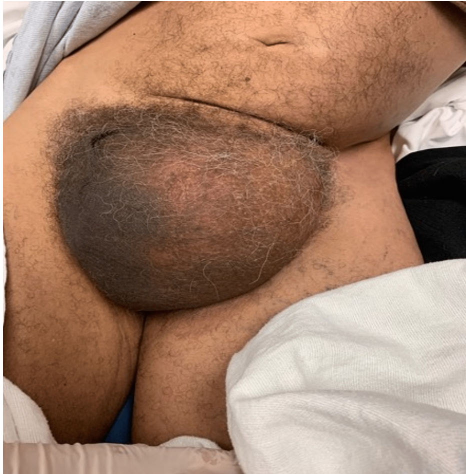
FIGURE 1: Large left inguinoscrotal hernia engulfing penis.

The results of the CT scan demonstrated a left inguinal hernia containing small bowel loops and a distended stomach without evidence of infarction. Gastric outlet obstruction was evident due to the antrum being compressed within the inguinal canal (Figures 2-5). The patient was subsequently resuscitated with aggressive intravenous fluids and broad-spectrum antibiotics. He was boarded and consented for an open left inguinal hernia repair with possible exploratory laparotomy. The left groin was explored via an oblique incision. A standard dissection was performed to explore the inguinal canal. Once the inguinal canal was exposed, the ilioinguinal nerve was identified and sacrificed proximally, and the iliohypogastric nerve was identified and spared. After dividing the cremasteric fibers, a large hernia sac was encountered and dissected from the cord. The sac was entered, and its contents included serous fluid, viable small bowel, and stomach. No obvious ischemia was noted. The excess sac was excised after reducing its contents and then closed with a purse string stitch using 3-0 Vicryl. An Ultrapro Hernia System-Large mesh (Ethicon Inc., Cincinnati, OH) was used to repair the hernia in a standard fashion. After completing the repair of the hernia, the skin was closed with a running 4-0 subcuticular stitch.