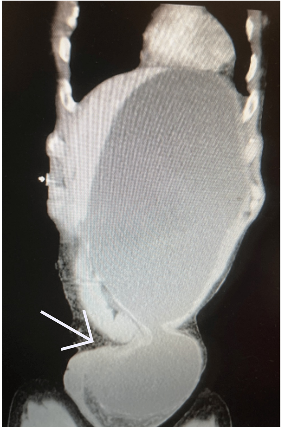
FIGURE 4: Computed tomography of abdomen and pelvis coronal cross section showing dilated stomach extending into the left inguinal hernia.

Arrow pointing to incarcerated left inguinal hernia containing stomach.