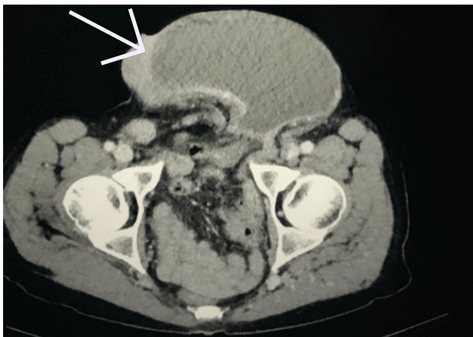
FIGURE 5: Computed tomography of abdomen and pelvis showing dilated stomach within left inguinal hernia sac.

Arrow pointing toward stomach within left inguinal canal.