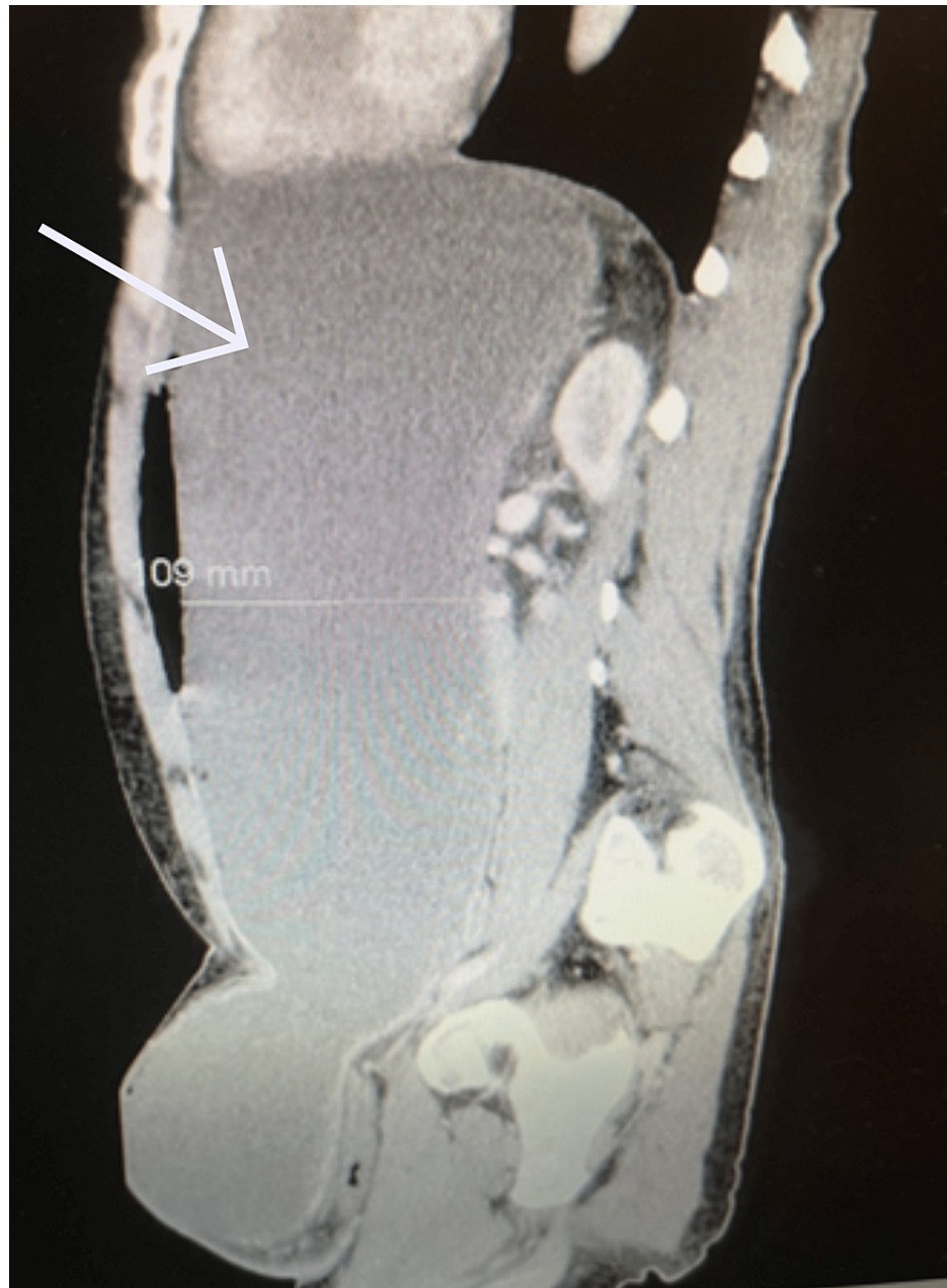
FIGURE 3: Computed tomography of abdomen and pelvis sagittal cross section showing dilated stomach extending into the left inguinal hernia.

Arrow pointing toward dilated stomach measuring 109 mm in depth.