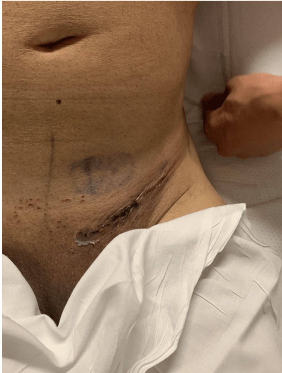
FIGURE 6: Image showing the final incision after surgery on postoperative day one.