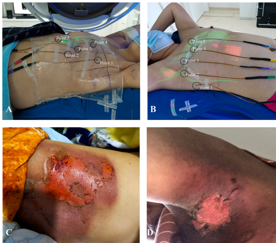
Fig. 2. A–B Using MOSFETs to measure 5 points of skin dose for patients, in B the MOSFET in point 1 was located outside the area directly covered by the treatment field; C grade 2 skin toxicity, erythema; D grade 2 skin toxicity, moist desquamation in the skin folder of the axillary.

iodine solution in cases of Grade 2 toxicity. The treatment will be interrupted if the patient experiences grade 3 skin toxicity and severe pain. The radiation oncologist will evaluate whether add the treatment fraction if the interruption is more than 14 days [13]. When the treatment finished, telephone follow-up was conducted weekly (from the sixth to the ninth week).