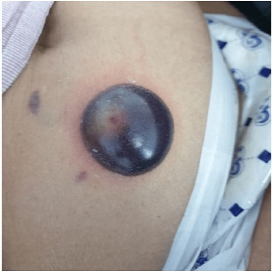
FIGURE 4: Day 14 of enoxaparin administration

Increase in the size of periumbilical bullae 4x5 cm in size.