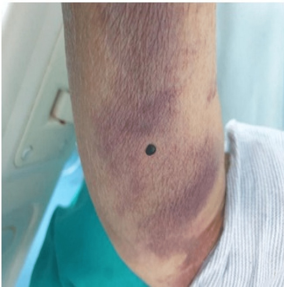
FIGURE 3: Day 9 of enoxaparin administration

Blackish bullae eruption 1x1 cm in size on the left upper medial forearm.