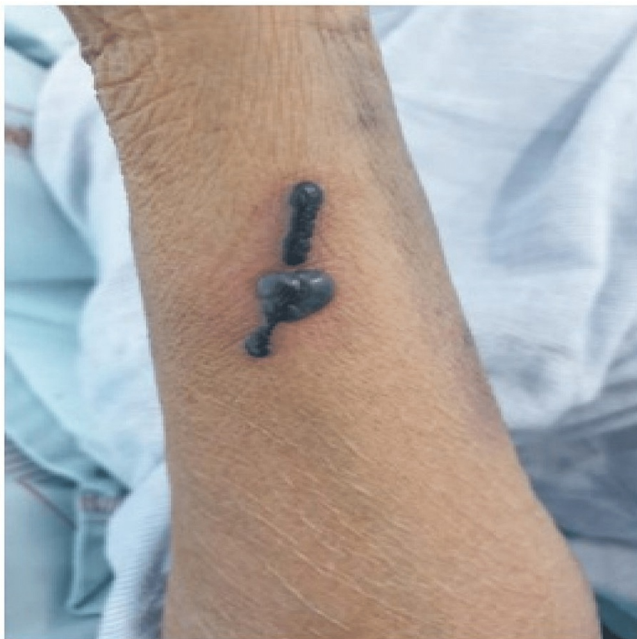
FIGURE 2: Day 8 of enoxaparin administration

Blackish bullae were noted on the lateral aspect of the right forearm.