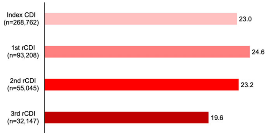
Fig. 3. Proportion of patients experiencing sepsis, by recurrence cohort. During the 12-month follow-up, 80,502 patients (30.0%) with CDI or rCDI experienced sepsis. All instances of sepsis were counted and, therefore, 1 patient could have had multiple sepsis events during follow-up. Sepsis events after the fourth or later CDI recurrence were not reported.

high mortality rates associated with sepsis and our exclusion of any patient who died for any reason during 12-month follow-up, our rates of CDI and rCDI may have been underestimated.