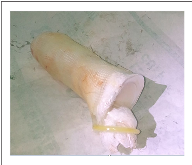
Figure 3. The improvised vaginal mold.

An improvised vaginal mold (Figure 3) was constructed with the barrel of a 50-ml syringe wrapped with a sterile gauze, following which a male condom was worn over it and then a sufratulle vaseline gauze was circumferentially applied around the gauzed syringe barrel. The mold was gently inserted into the vagina wall as far reaching as possible (Figure 4). The essence of the vaginal mold was to prevent possible vaginal stenosis during healing.