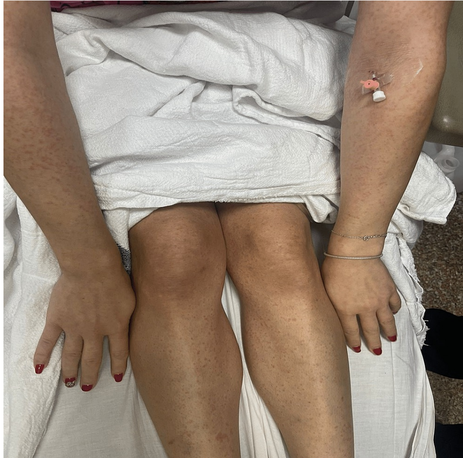
FIGURE 1: Generalized rash the patient developed two days after the filler injection

On review of systems, she had postural hypotension, decreased level of consciousness, weakness, dizziness, and loss of appetite. Also, she had hoarseness of voice, constipation, dysphagia, and heartburn. Furthermore, the patient had a generalized rash, as demonstrated in Figure 1. All of them happened two days after the filler injection.