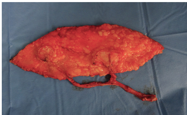
Fig. 2 In case of two perforators feeding the superthin flap, two separated adipofascial cylinders centered on each perforator are harvested.