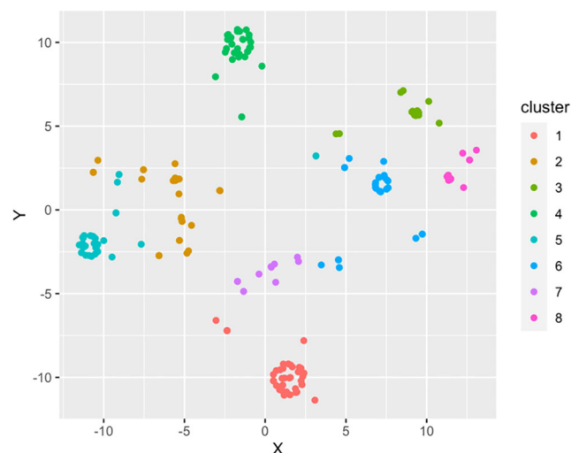
Figure 2. Viewing Gower clusters.