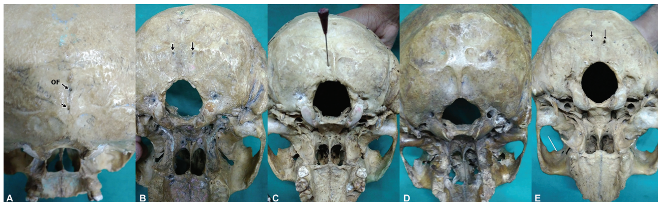
Fig. 1 Occipital foramen (OF) in the midline (A), OF bilateral (B), OF unilateral (C), OF absent (D), and OF bilateral to midline with canal (E).