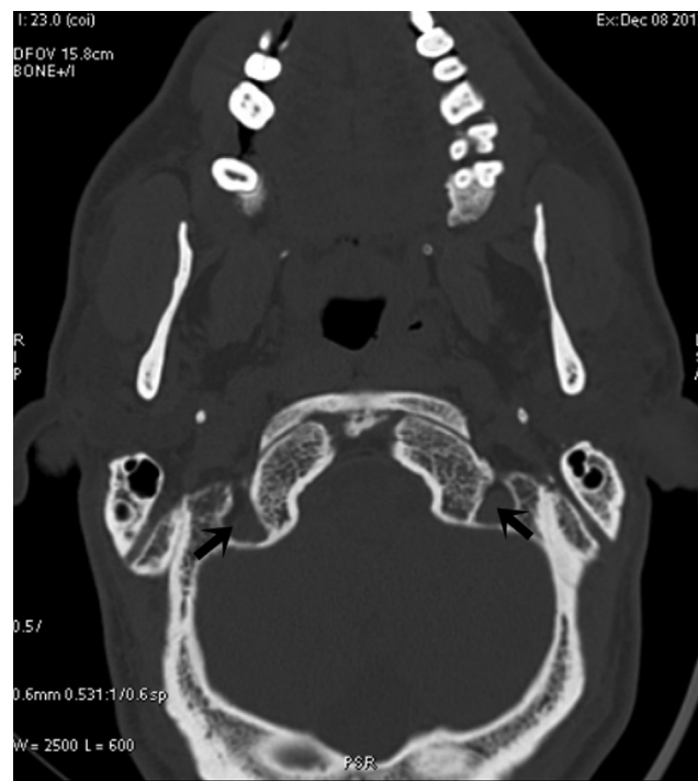
Fig. 3 Bilateral posterior condylar canals appearing as simple foramina with no variations in perforation or bony spicule or canal (black arrows).