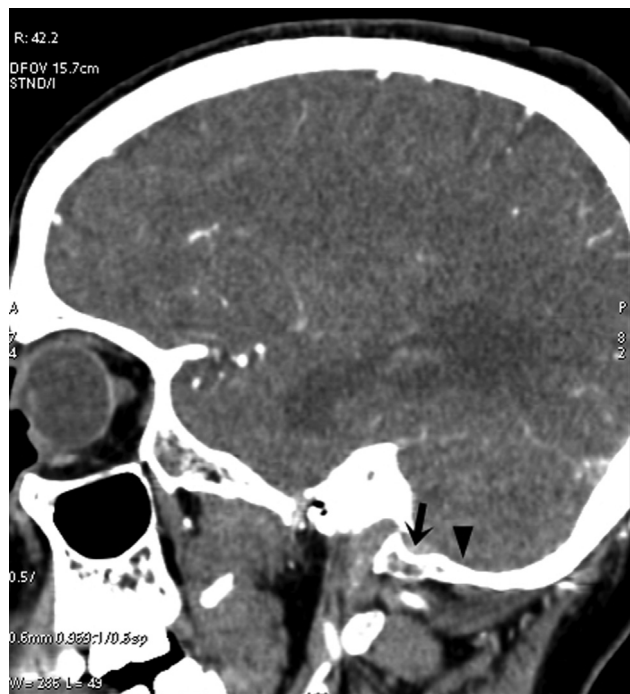
Fig. 4 Computed tomography angiography of posterior condylar foramen, posterior condylar canal (PCC), and posterior condylar vein (PCV). A sagittal multiplanar reformatted image demonstrates the PCV in the PCC (black arrow) arising from the jugular bulb (black arrowhead) draining into the deep cervical vein and the horizontal portion of the vertebral venous plexus.

The incidence of PCC in various population reported by several studies can be seen in literature. In a first ever study by Boyd, 16 presence of PCC was reported in both sides in 46.6% of skulls, the higher percentage than in the case of any other foramen. Boyd also found that PCC is absent on both sides in only 23.1% and he also noted that unilateral condylar foramen is present rather more often on right side than on the left side (16.5 and 13.8%). In Australian skulls, PCC is