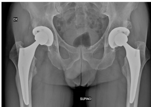
Figure 2 Patient with bilateral prosthesis. Right hip at 36 mo since surgery with distal femoral cortical hypertrophy in Gruen zones 2 and 3; left hip at 18 mo postoperative without cortical hypertrophy.