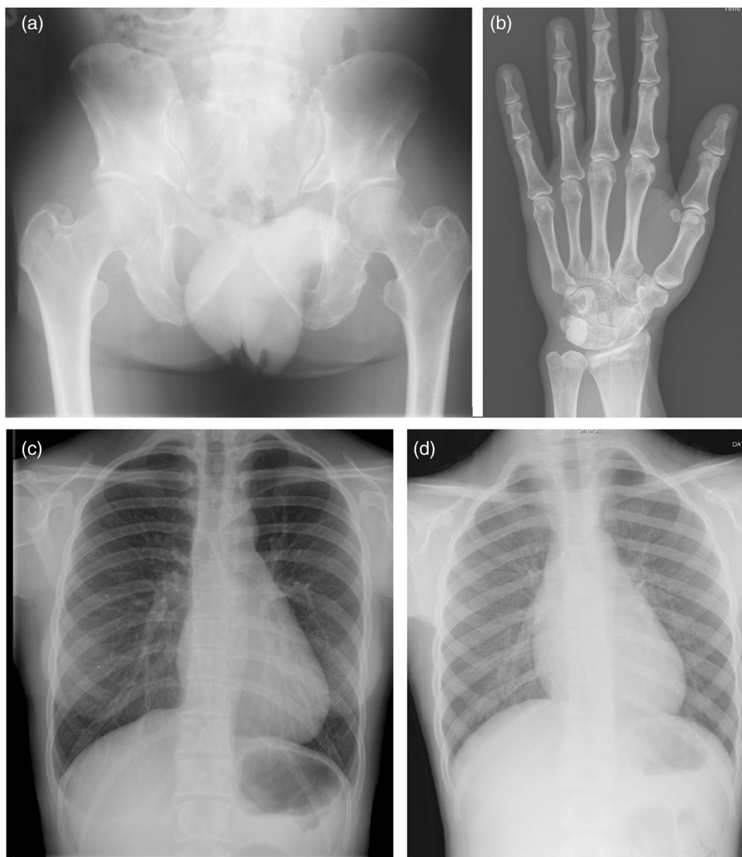
FIGURE 3 X-ray of the pelvis, hand, and thorax. X-rays of the (a) pelvis (II-1), showing hypoplasia of the iliac wings; (b) hand (II-1), showing fusion of the carpal bones and thorax (II-1 [c], and III-1 at 8 years of age [d]) showing hypoplasia of the scapulae.