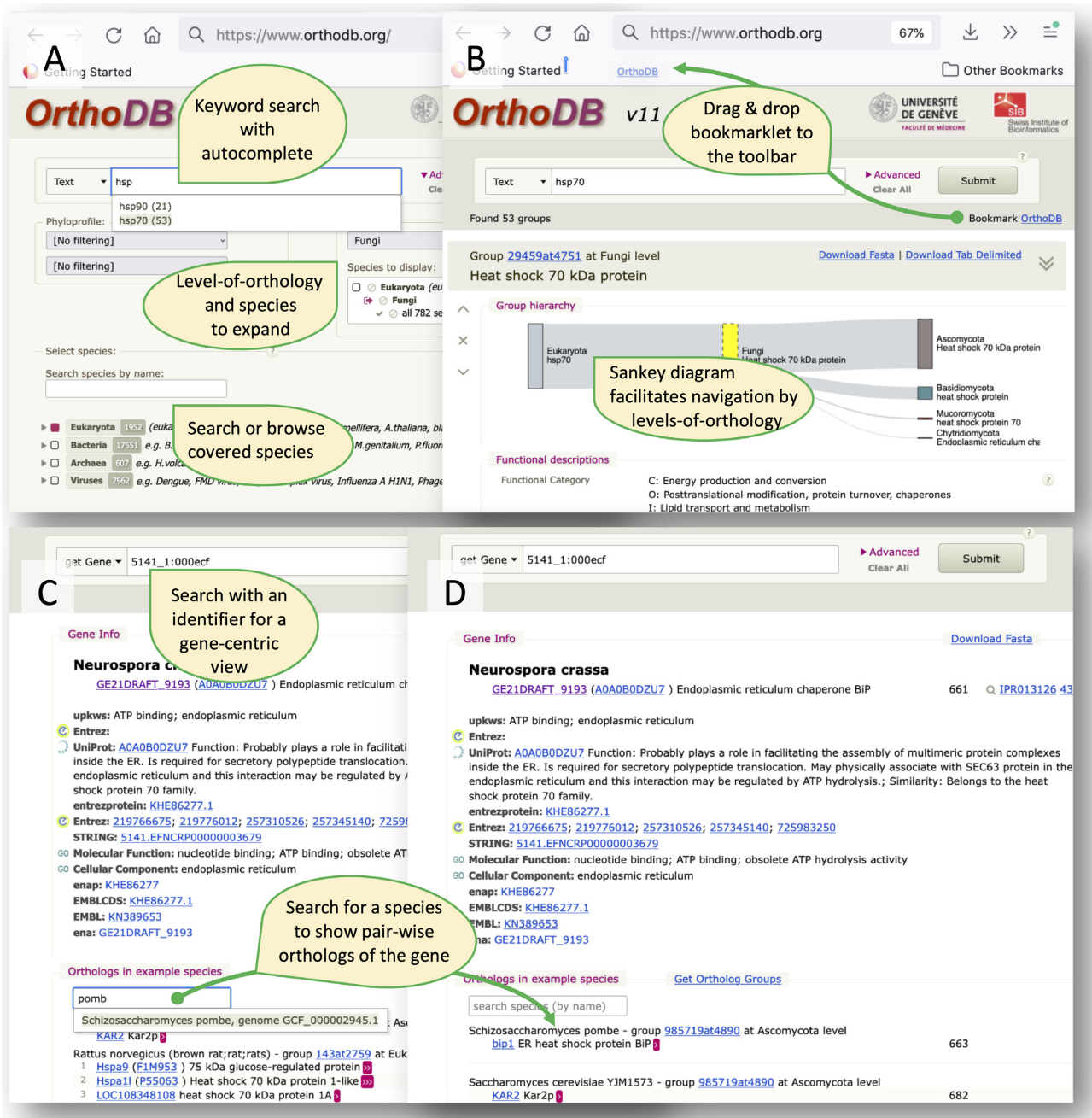
Figure 1. Elements of OrthoDB web interface: (A) the ‘Advanced’ section of the web interface enables user-tailored selection of organisms to focus on, specifying explicitly relevant levels of orthology, or phyloprofile filters. (B) the OG-centric results page shows an interactive Sankey diagram facilitating the navigation between the levels-of-orthology, and it presents a bookmarklet link that one can drag & drop to the browser toolbar for easy OrthoDB queries next time with the same filter settings. (C) the gene-centric view provides available gene annotations and a list of pair-wise orthologs in example species. (D) One can search for species of interest to list pair-wise orthologs in this species.

affecting rates of gene duplication and losses as well as rates of sequence divergence. While single-copy orthologs are the easiest to identify, disambiguating relationships in large multi-gene families can be tricky, especially with frequent gene losses in addition to duplications. Thus, instead of reporting a single figure for precision, sensitivity, or the composite F1 score averaged over the sampled gene families as usually done (37), it is more illustrative to plot the value of the standard metrics on the x-axis with the counts of