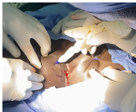
Fig. 2. Flap created perpendicularly to the longitudinal incision.