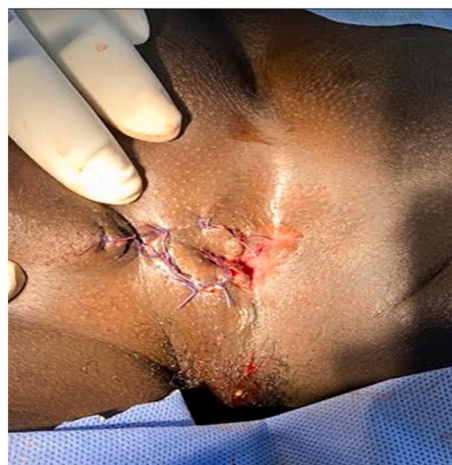
Fig. 4. After anoderm and perineal skin stitched to the flap's sides.

replaced by variable degrees of constricted, non-elastic cicatrized tissue [9]. Both intrinsic and extrinsic pathological mechanisms can result in stenosis. A number of disorders that result in non-cutaneous scarring sores can lead to anal stenosis. The stenotic segment may be situated close to or far from the anal canal, but most frequently, the entire anal canal is recognized to be affected by the abnormalities [5]. Overzealous hemorrhoidectomy is the primary cause of stenosis of anal canal in 90 % with an incidence of 1.5 %–3.8 %. However, in the study done by Njadat, Rumman, Maaita, Almbaidin and Qusus [10], the incidence of anal