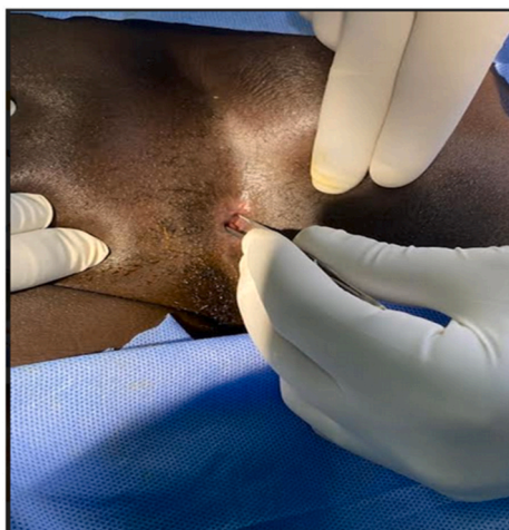
Fig. 1. Anal canal not allowed a small finger but a dissecting forceps.

Anal stenosis is a constriction of the anal canal that can be caused by either a true anatomic stenosis or a functional hypertonic internal anal sphincter. In functional stenosis, there is a hypertonic internal anal sphincter while in anatomic stenosis (stricture), a normal anoderm is