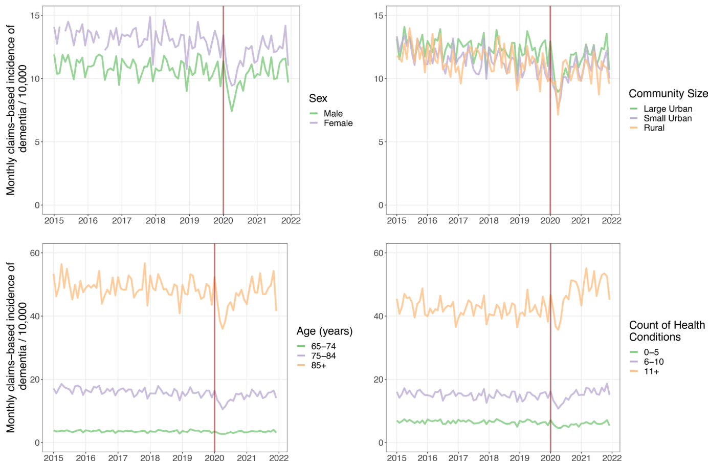
Figure 2 Claims-based incidence of dementia in Ontario, Canada between 2015 and 2021 by sex, age, and community size, and count of health conditions.

lower-than-expected incidence within large urban areas is at a glance surprising as individuals within these areas typically have the greatest access to healthcare. 29 However, the shift to virtual visits was most pronounced in urban areas. 9 Additionally, urban areas were under strict public health measures for longer periods of time and therefore individuals in these areas may have experienced longer delays in resuming normal health service use levels. 30