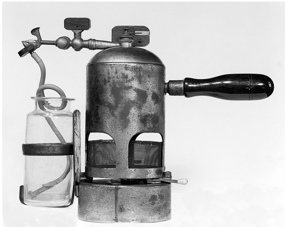
FIGURE 5: The Lister carbolic spray.