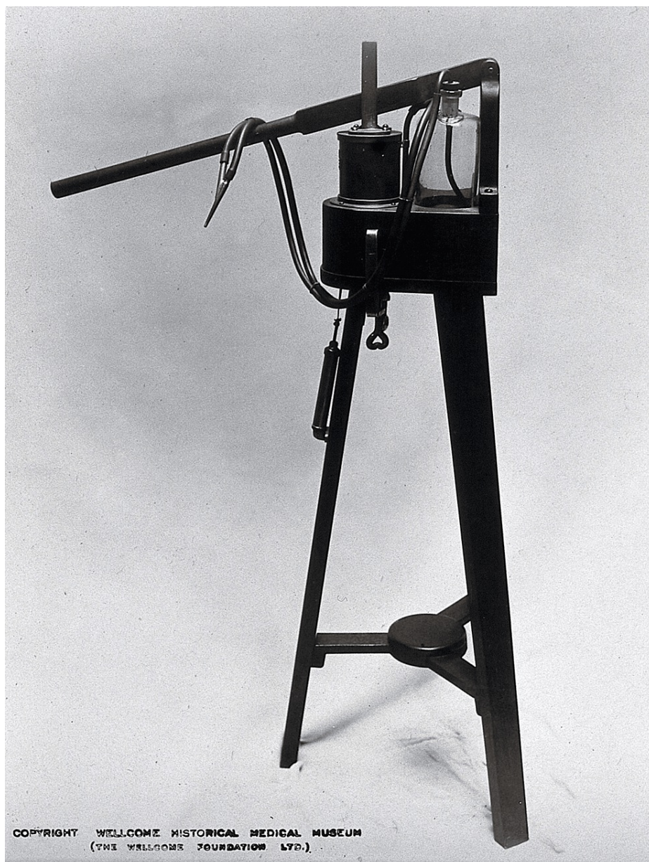
FIGURE 4: Donkey engine used by Joseph Lister. Photograph, 1927.