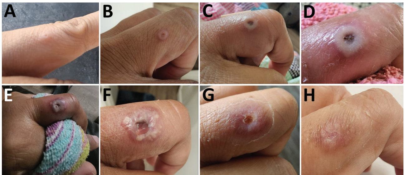
Figure 1. Evolution of finger skin lesions in healthcare worker occupationally exposed to monkeypox virus, California, USA, 2022. A) August 29; B) August 31; C) September 4; D) September 5; E) September 6; F) September 7; G) September 24; H) September 28.

The HCW works as a physician at 2 clinics that primarily serve LGBTQ+ and HIV-positive patients. She sees 15 patients/day and regularly sees patients with mpox, during which she wears full personal protective equipment (PPE) (N95 respirator, a gown, and eye protection). During the presumed incubation period, the HCW interacted with 2 patients