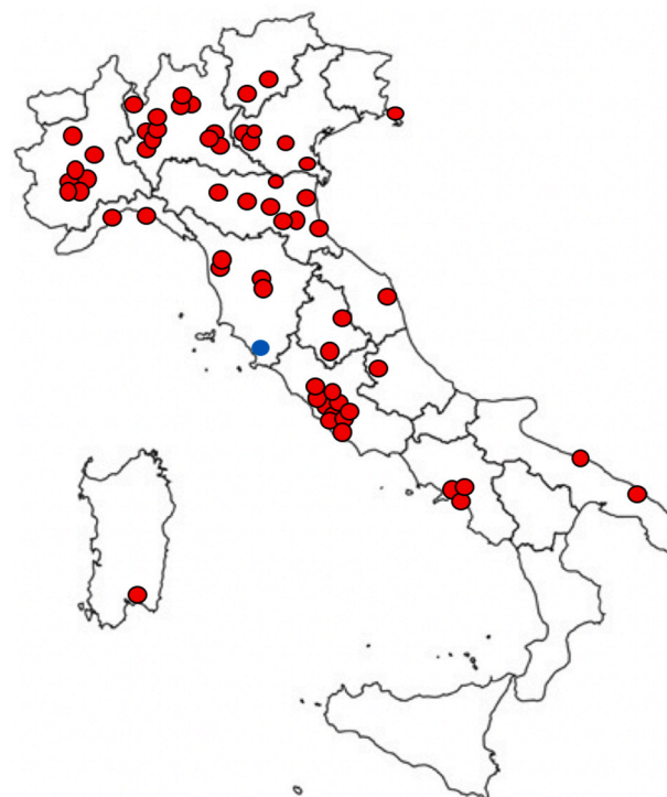
Fig. 1. Geographical distribution of participating centers. Blue: coordinating center.

Overall, 62 Italian surgical divisions sent complete data for both