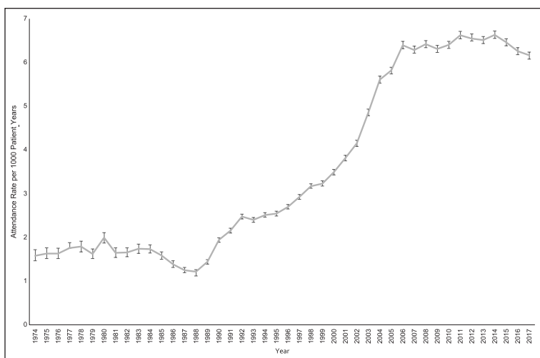
Figure 1. Attendance rate for all patients with persistent orofacial pain diagnoses over the 44-y study period. Number of patients = 301,832. Actual attendance rates and 95% CIs are shown.

BMS, burning mouth syndrome; CI, confidence interval; TMD, temporomandibular disorder.