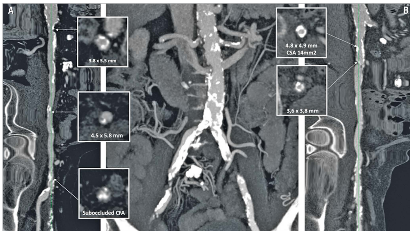
Figure 1. Preprocedural computed tomography (CT) scan to assess iliac and femoral calcification in order to evaluate TAVI access. Case example (part 1). Central panel: CT image of the iliac bifurcation showing severe tortuosity and calcification of both iliac arteries. CT longitudinal image of the severely calcified right common, external iliac and right common femoral artery (CFA) (panel A) and left common external iliac artery (panel B). In each panel, multiple cross-sections with diameters, area of near circumferential calcification and thick protruding nodules are shown. The right common femoral artery was the access artery selected for this patient, who underwent IVL treatment as shown in Figure 2. CSA: cross-sectional area; IVL: intravascular lithotripsy; TAVI: transcatheter aortic valve implantation

tortuosity of the iliac vessels assessed by CT. For elective cases, after insertion of a 0.014-inch guidewire, a dedicated IVL balloon was delivered, in the majority of cases preferring the largest available IVL balloon (Shockwave M 5 , 7 mm; Shockwave Medical) ( Figure 2 ). A short 10 Fr sheath was generally used to advance the IVL system from the main access side, after deployment of the pre-implanted closure device system, while a 45 cm, 7 Fr sheath was preferred in case of a contralateral approach. During repeat balloon inflations at low pressure (3-4 atmospheres), multiple pulses were delivered, completing (in the majority of cases) the whole cycle of pulses available (300) for each balloon. Post-dilatation with a conventional non-compliant (NC) balloon was left to the operator's choice. For bail-out procedures, IVL was used after failure to advance the delivery sheath or the valve deployment system.