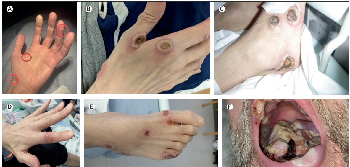
Figure 1: Photos of the lesions

(A) Early lesions over that patient's hand. (B) Active lesions to hand. (C) Active lesions to foot. (D) Healing lesion to hand. (E) Healing lesions to foot. (F) Active lesions to floor of mouth and lips.