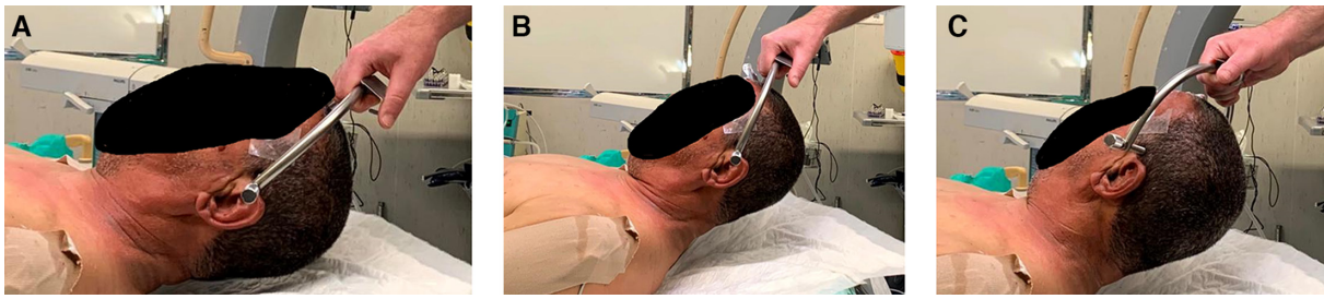
Figure 1. Closed reduction based solely on cranial manual traction without weights. (A) Neutral position; (B) flexion position; (C) neck flexion and rotation.

performed in awake patients in order to closely monitor them clinically. After the imaging study was finished, the patient with cervical facet dislocation was transferred to the operating room where appropriate analgesic medication was given by the anesthesiologist. With the patient awake, local anesthetic was administered to the cranial pin site and the pins were placed. The pin location was 1 cm above the pinna and 1 cm posterior to the line of the external auditory meatus and below the equator of the skull. This more posterior pin location allows for a slight cervical flexion during traction, which aids in the dislodgment of the perched facets.