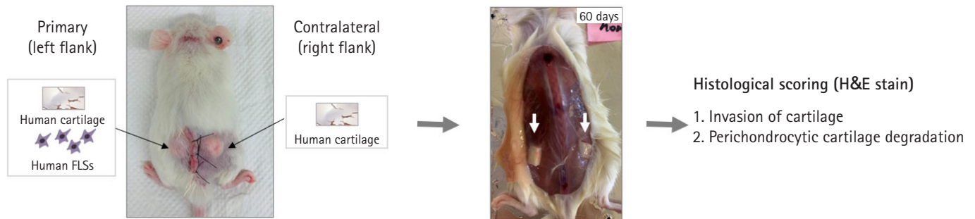
Fig. 2. Schematic of model using synovioyte migration and invasion SCID. Cartilage and rheumatoid arthritis-FLSs were coimplanted into SCID mice at the primary site and cartilage without cells was implanted at the contralateral site. After 60 days, the implants were removed, embedded in paraffin, and stained with hematoxylin and eosin (H&E). Implant evaluation was performed using H&E-stained sections to determine invasion and perichondrocytic cartilage degradation. SCID, severe combined immunodeficiency; FLS, fibroblast-like synovioyte.