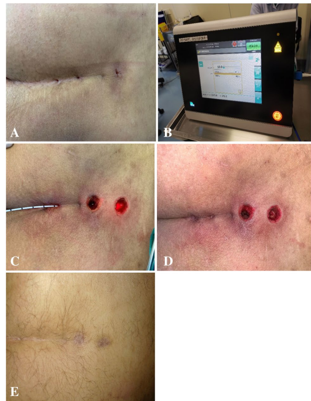
Fig. 1 A The pits before the operation, B Biolitec device used for sinus laser treatment, C destruction of the tract with the laser, D after the operation, E successful healing at 1 year

infusion, taking into account the age, height, and weight of the patient). Anesthesia was induced by 3 µg/mL and maintained by 2 µg/mL propofol. Then, a probe was used to evaluate the length and extent of the sinus from the pit (if there were multiple pits, the sinus tracts were evaluated separately). According to the size of the sinus infection area, a circular or oval incision was made to widen the existing sinus appropriately to ensure sufficient drainage. Mosquito clamps were used from the incision to clean the hair in the sinus tract. Then, the sinus tract was cleaned with a curette. The optical fiber (Leonardo Dual 45 Laser 980 nm/1470 nm, CeramOptec GmbH of Biolitec AG, Bonn, Germany, single radial laser fiber) was probed from the small concave side, under the guidance of the indicator light, along the sinus tract to the end. The laser power was 10 W and the wavelength was 1470 nm. The parcel was ablated between the sinus and pit by pulling the optical fiber at 1 mm/s. The situation before and after operation is shown in Fig. 1.