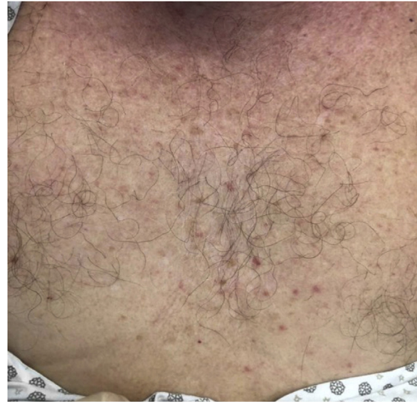
Figure 1 Erythematous rash containing macules and papules.

The authors collected 50 cases of new-onset dermatologic symptoms in patients with laboratory-confirmed COVID-19 treated at Sírio-Libanês Hospital from February to June 2020. The main demographic and clinical findings are summarized in Table 1. The age of the patients ranged between 18 to 99 years, with a mean of 57 years (SD = 18.6 years), and 54% were male. Most patients (74%) had some type of comorbidity and 76% were hospitalized for a mean period of 17.7 days, ranging from 0 to 120 days. Among patients with a