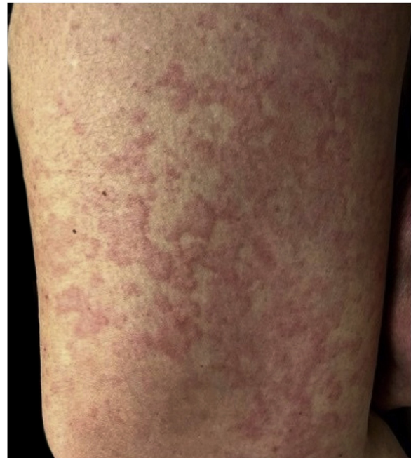
Figure 2 Urticarial rash.

more severe disease, 46% required non-invasive ventilation, 32% were under invasive ventilation, 8% were submitted to dialysis, 4% needed ECMO and only one patient died.