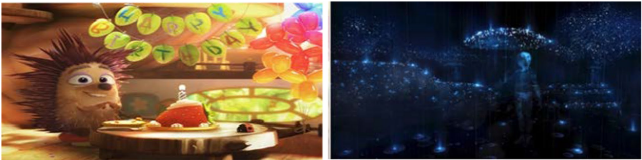
Fig. 1 To the Left: A screenshot of the birthday celebration of a Hedgehog. To the Right: A Screenshot of documentary on visual impairments

Based on these criteria, four virtual environments were included in the study (see Figs. 1, 2). Two were free to access non-interactive 360° video-based and two were interactive virtual environments. Non-interactive virtual environments were: (1) Birthday celebrations of a hedgehog, and (2) Documentary of a person with visual impairment. Non-interactive virtual environments were selected from a range of videos in each category, based on the ratings the attendees provided using a Likert scale 1–5. Interactive virtual environments