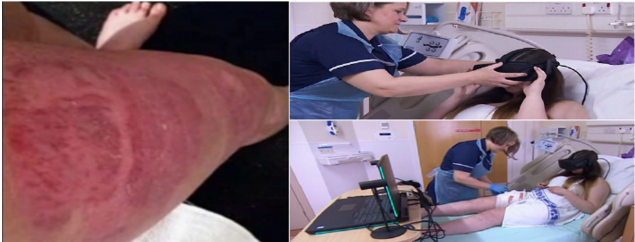
Fig. 3 To the Left: the picture depicts the burn-injured body part. To the Right: the picture depicts the VR treatment

Burn-injured patients were found to be able to tolerate perceived pain and increase the duration of the dressing changes. In particular, it was found that during the VR exposure the burn-injured patients were feeling significantly less pain compared to the regular wound debridement, dressing changes and wound cleaning where no VR intervention was used (Table 3). This results in an increased tolerance against pain, which allowed the nurses to remove more dead tissues from the wound. It was found that burn-injured patients were feeling significantly less anxious during the VR dressing changes compared to the non-VR (Table 3).