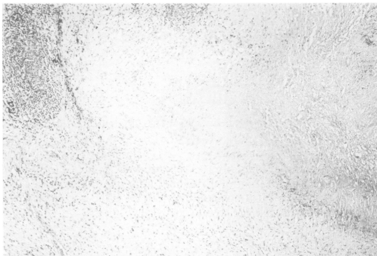
Fig. 1 Edge of a rheumatoid nodule seen on the pleural surface of an open lung surface. (Haematoxylin and eosin; \times 195 ).