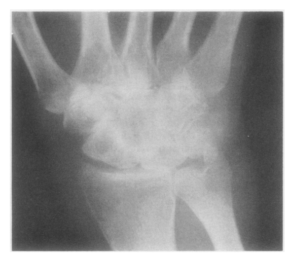
Fig. 2 Radiograph of the right wrist revealing classical changes of adult Still's disease including intercarpal and carpal-metacarpal narrowing and fusion.

dyspnoea, and pulmonary function tests revealed no significant improvement.