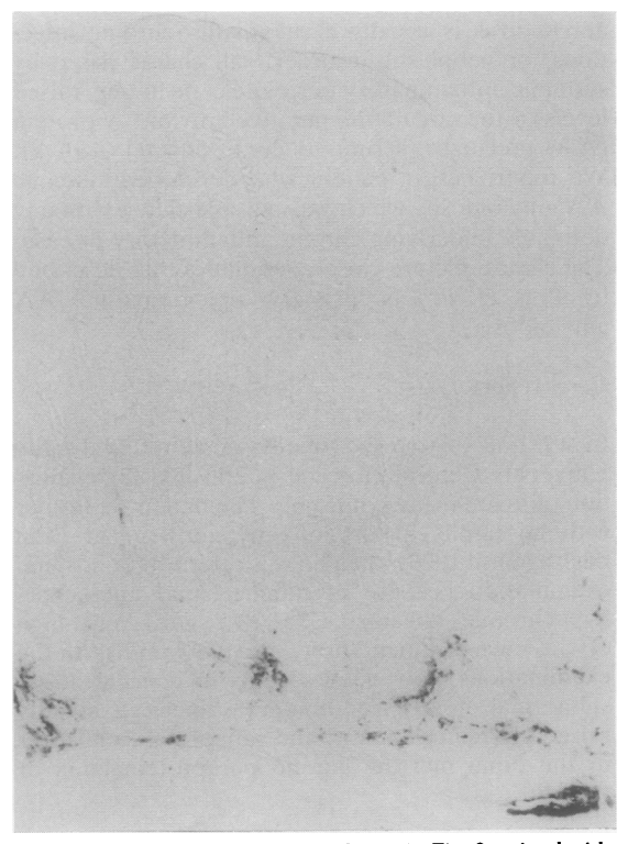
Fig. 3 Section adjacent to that shown in Fig. 2 stained with anti-AA antiserum, showing dark reaction product over amyloid deposits (× 140).

Biopsy specimens were fixed and processed routine'ly into paraffin. Sections were stained with haematoxylin and eosin and in selected cases with alcian-blue-periodic acid-Schiff reagent (AB-PAS)