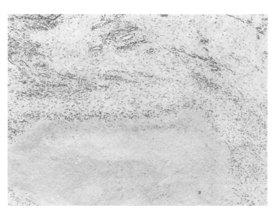
Fig. 1 Foot nodules. Palisading histiocytes surrounding foci of necrosis and perivascular lymphoplasmocytes infiltration are evident. (Haematoxylin and eosin.)

Biopsy specimens were obtained from the old nodules (elbows) and from the new ones (dorsum of the feet). The recent nodules (Fig. 1) demonstrated dense connective tissue surrounding palisading granulomas with central fibrinoid necrosis and prominent perivascular infiltrate of lymphoplasmocytic cells (Fig. 1). The old nodules showed denser connective tissue surrounding necrotic nodular areas without peripheral palisading, irregular collections