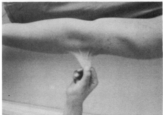
Fig. 1 Skin hyperelasticity.

A young man age 16 years consulted for weakness of